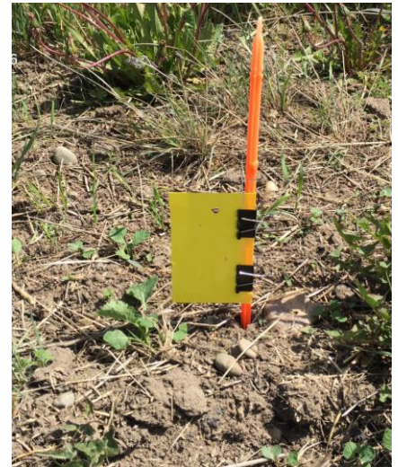
Sticky card used for flea beetle monitoring

Monitoring for flea beetle species began June 3, 2016. Three flea beetle monitoring locations were set up in canola fields throughout the BC Peace; Flatrock (River Crest Farms), Doe River (Doe Creek Farms) and Tower Lake (Critchler Farms). Jennifer Otani's pest monitoring program at AAFC Beaverlodge also has two locations: one in Baldonnel and one in Rolla. Two striped flea beetles are still the predominant species found on the sticky cards in the first week. Fields were inspected for damage however due to the excellent growing and moisture conditions that the sites currently have there was minimal damage to the canola seedlings.