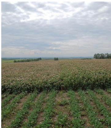
Red clover seed field in the AB Peace