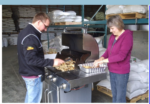
Foster's Seed & Feed provided a wonderful BarBQ lunch for the summer tour in 2011.

Topics include: Carbon credits & forages Roundup ready alfalfa Market updates Research highlights Joint AGMs Call: Calvin at 1 780 869 3879 or Chris at 1 877 630 2198