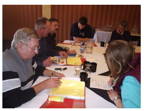
Directors retreat & governance workshop in Grande Prairie in Apr, 2011