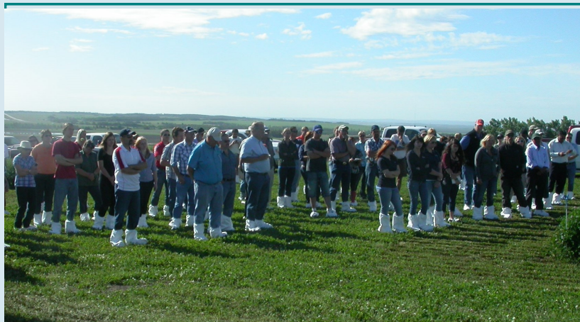
Summer Tour at Beaverlodge Research Farm in July 2013

The vision is to improve the quality, consistency and profitability of the turf and forage seed industry in the Peace River Region.