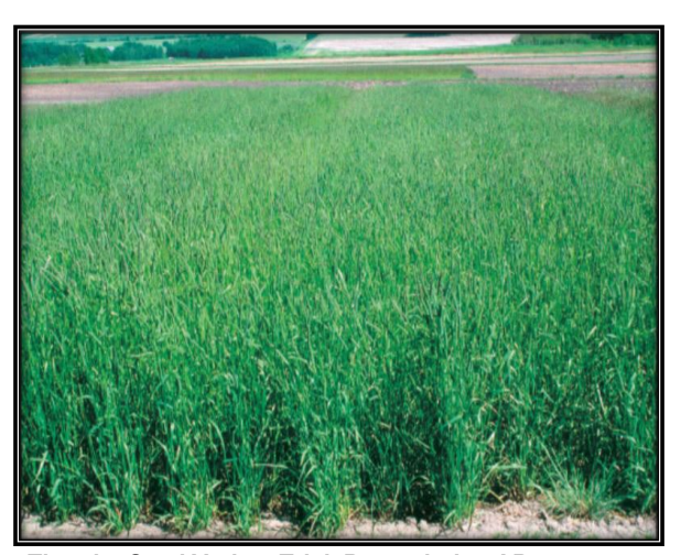
Timothy Seed Variety Trial, Beaverlodge AB

Canadian pedigreed forage grass seed production is focused primarily on timothy (2021 = 29,850 ac), with the bromegrasses (mainly smooth and meadow at 6,300 ac) and wheatgrasses (4,850 ac) following suit. Bromegrass production is found mainly in Alberta (3,380) and Saskatchewan (2,360). Alberta has the majority of timothy acres (12,600), although Manitoba's (8,470) and Saskatchewan's (6,600) acres are substantial. 2021 Canadian timothy acres are still 4,700 below the 10 year average. 2021 saw wheatgrass acres drop by 2,280 (32%) to 4,850 acres, its lowest acreage level since 2013.